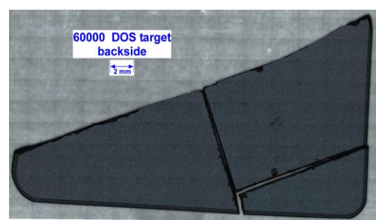
Figure 4: This photo shows the target wafer after cleaving scribe lines 1 & 2. The requested allocation piece is in the upper right hand section of the photo.

The mounted target was removed from the transport container and placed on the laser's vacuum stage. The stage was adjusted such that the target was in position for implementing scribe 1 using the Y direction of the stage. The wafer was scribed using the scribing plan discussed above. After each set of scribes 31 lines, the mounted target was boxed up and returned back to the Genesis anteroom to clean out the Si "fluff". Once the entire process on scribe 1 was completed, the target was un-mounted in the Genesis anteroom and cleaved using the cleavenator<sup>1</sup>. The appropriate target piece was then remounted as described above and scribe 2 was done in a manner similar to scribe 1 discussed previously. When the entire scribe 2 processes was finished, the target was un-mounted in the Genesis anteroom and cleaved between two glass plates<sup>1</sup>. Figure 4 shows the target piece after it was successfully cleaved. The requested allocation piece has been delivered to the requestor.