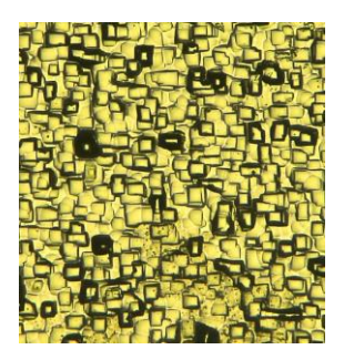
Figure 1: 700x optical micrograph showing the observed square patterns on a non-flight z-axis oriented FZ silicon wafer. Looking carefully at the image one can easily determine the 100 and the 010 directions on the wafer.

Materials and Methods: In order to minimize the possibility of unintended breakage of the actual target wafer during subdivision, a careful detailed study involving numerous laser scribing plans was undertaken. In all cases though, the laser scribes were done along a major crystallographic plane in order to maximize the probability of a successful cleave. It turns out that identification of the major axes of a FZ silicon wafer is easily done using a > 500x optical image of the wafer. Our polished Z-axis oriented non-flight single crystal FZ silicon wafers present a pattern of oriented squares along the specimen's primary crystallographic planes when viewed at high magnification using an optical microscope. In other words, the 100 and 010 directions are easily picked out using the axes defined by the oriented square patterns. Figure 1 shows such an image.